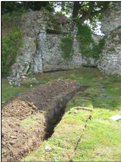
Trench north of walls looking south-east