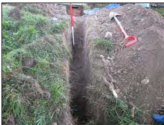
Pipe trench south of walls