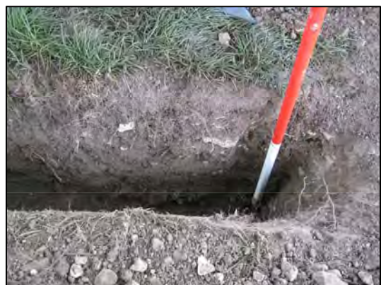
Sample section of pipe trench south of walls