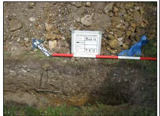
Sample section of trench north of walls