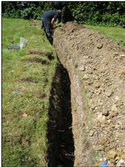
Trench north of walls looking north-west