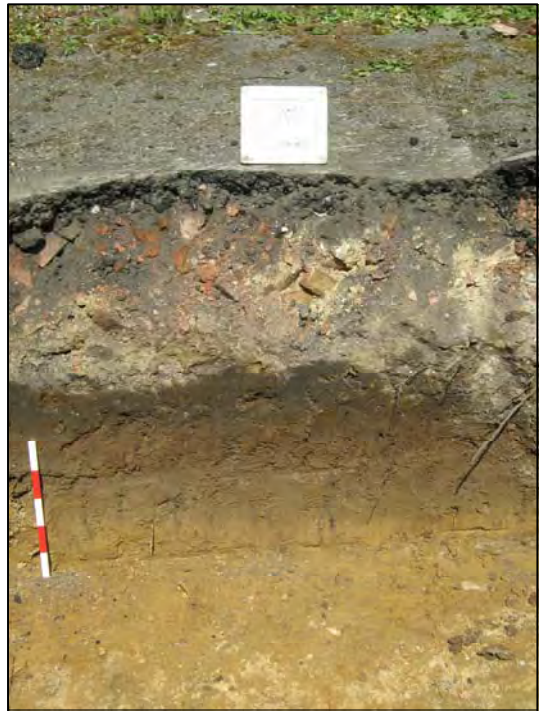
Trench 1: sample section