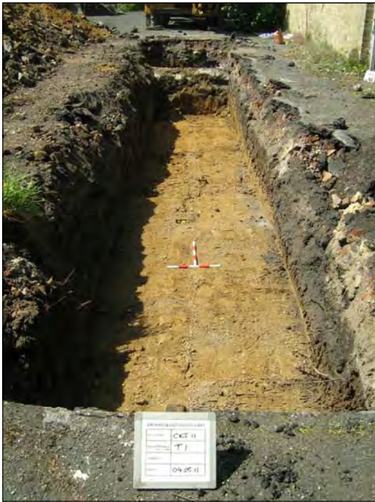
Trench 1 looking west