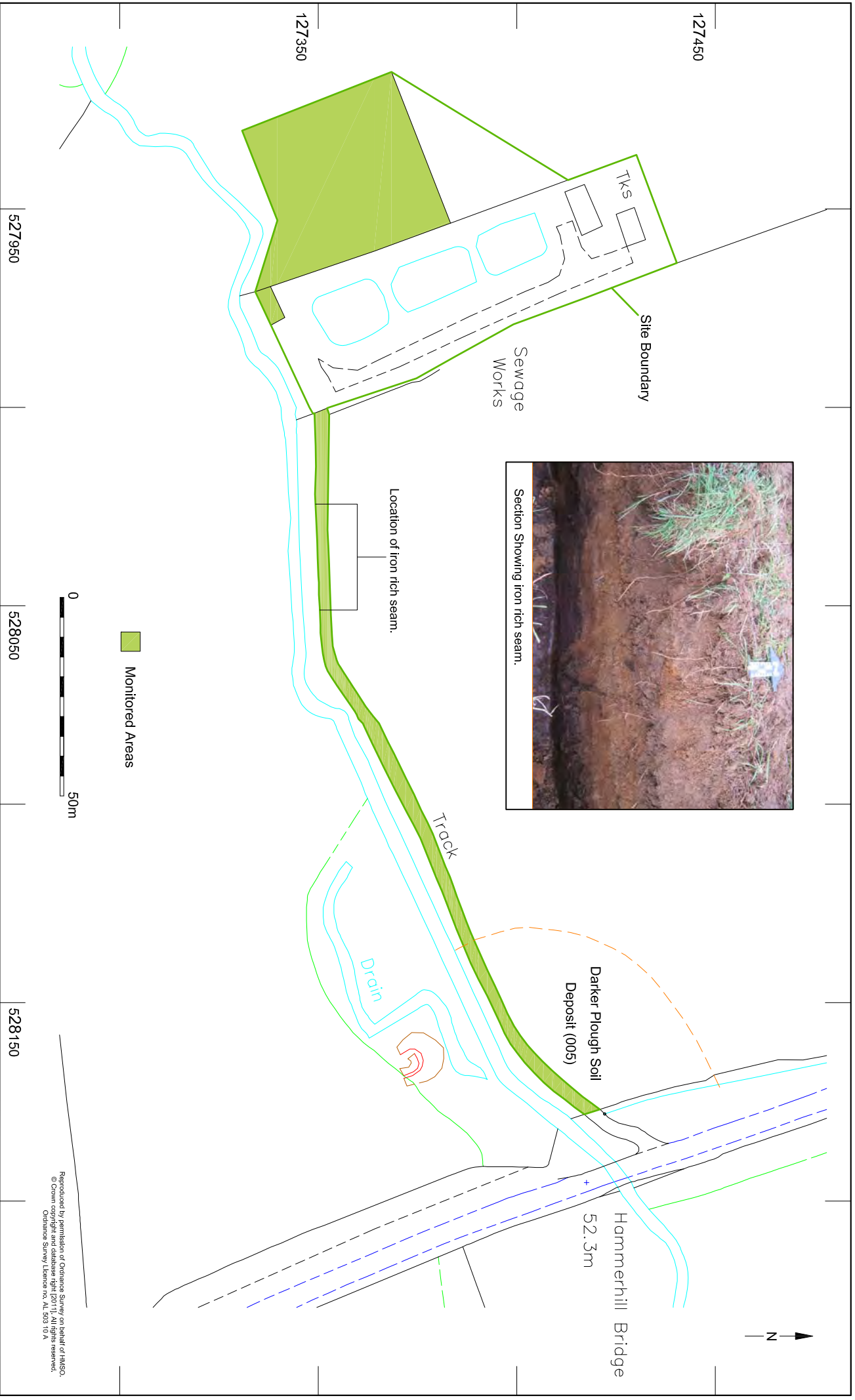
Hammerhill Bridge, Staplefield Project Ref: 4841 March 2011 Monitored Areas Report Ref: 2011050 Drawn by: DJH