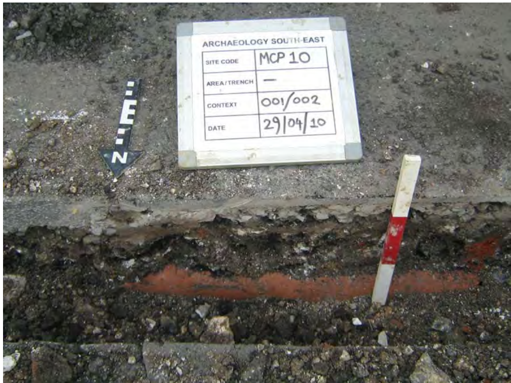
Fig. 3: Photograph of a typical section through the exposed stratigraphy