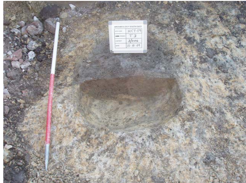
Pit associated with iron working