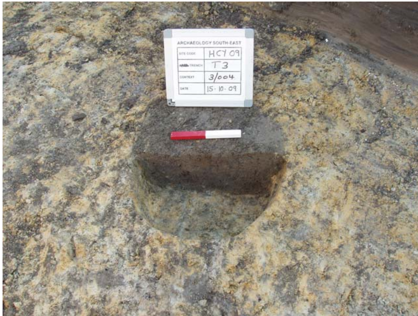
Pit associated with iron working