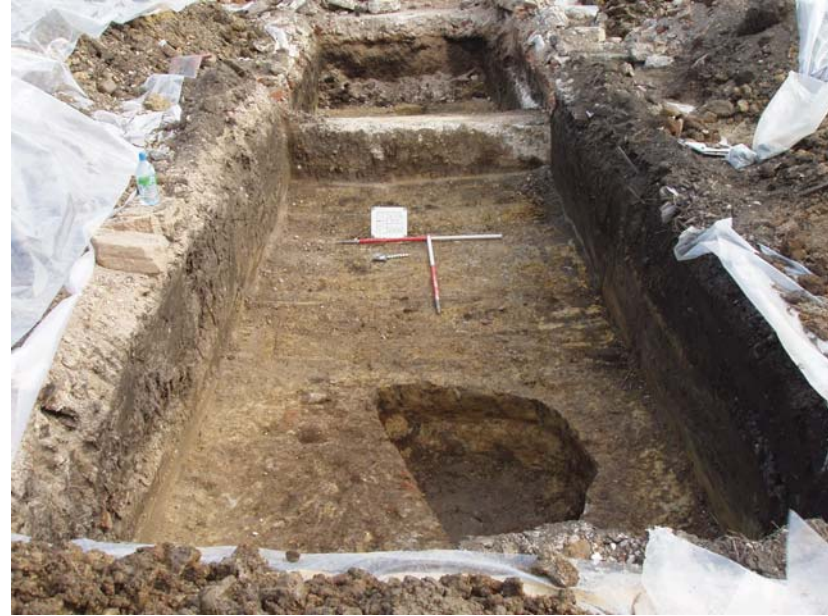
Trial trench with 15th-16th century pit in foreground