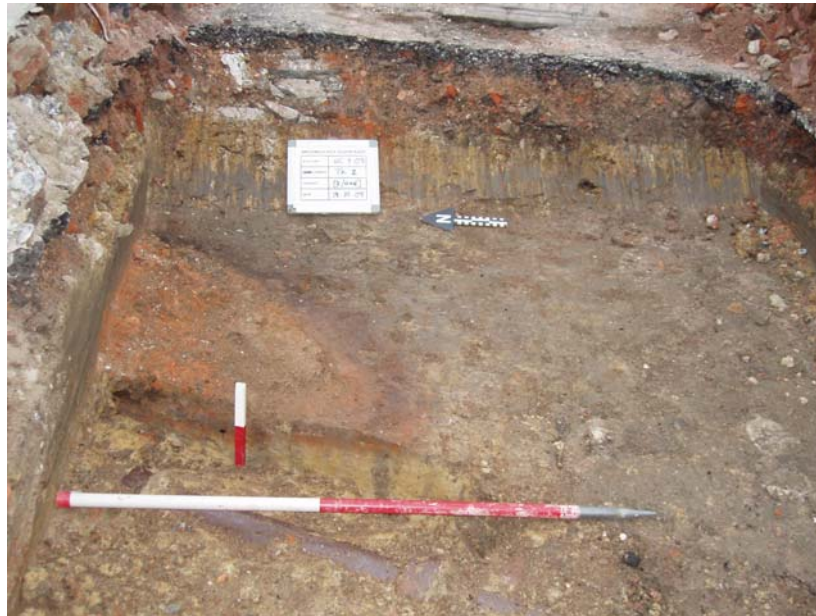
Possible smelting furnace of 14th -15th century date