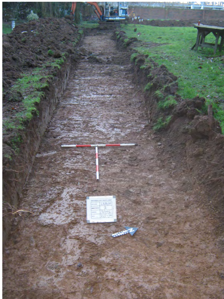
Fig. 6. Trench 2 view along trench