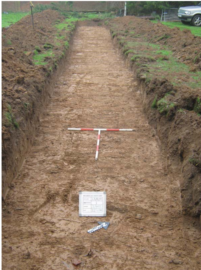
Fig. 4. Trench 1 view along trench