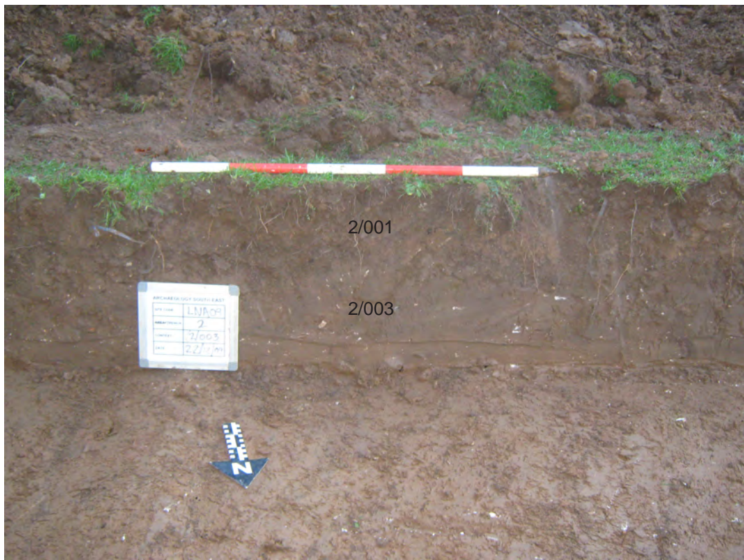
Fig. 5. Trench 2 sample section