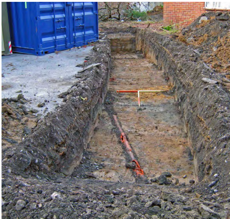
Fig. 6: Trench 2 looking north-west