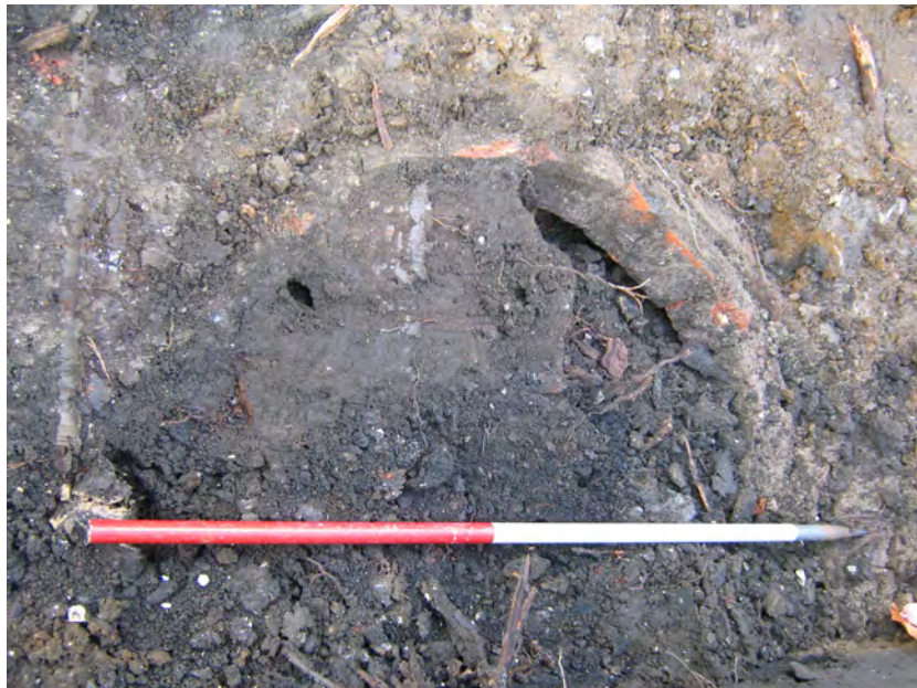
Fig. 4: Cistern tank or well in Trench 1