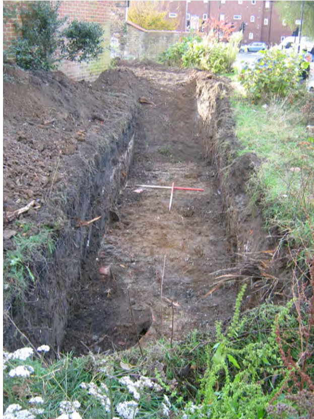
Fig. 3: Trench 1 looking west