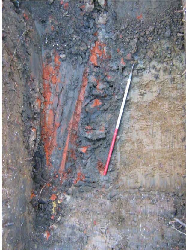
Fig. 5: Cellar or drain in Trench 1