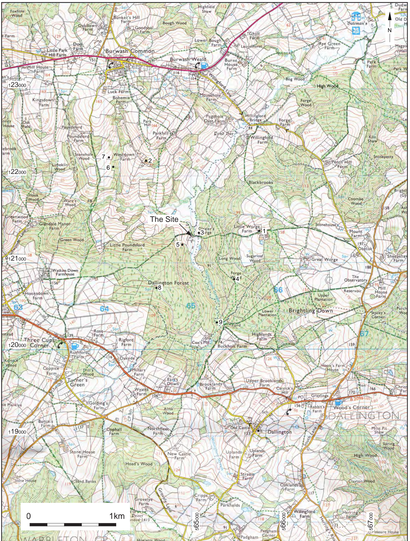
Glazier's Forge Farm Fig. 1 Project Ref: 3797 April 2009 Site location and ESCC HER data Report Ref: 2009062 Drawn by: JLR

Reproduced from the Ordnance Survey's 1:25000 map of 1997 with permission of the Controller of Her Majesty's Stationary Office. Crown Copyright. Licence No. AL 503 10 A