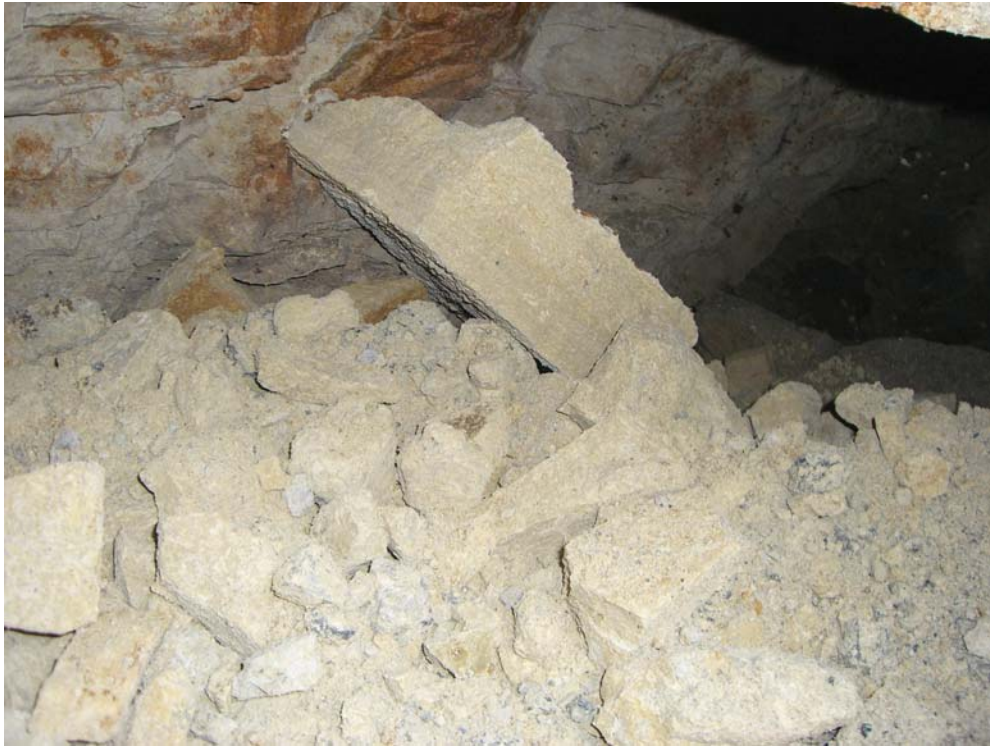
Fig. 4 View into void facing east