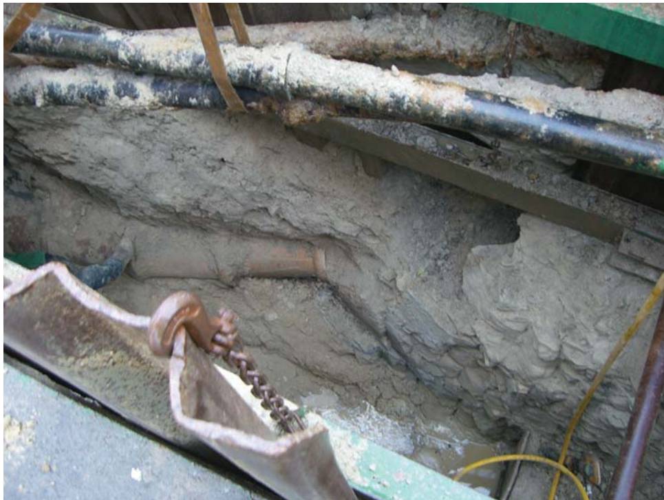
Fig. 5 Void space (right of photograph) with sewerage pipe below