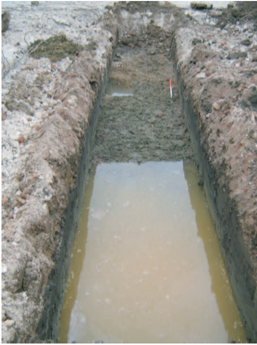
Plate 1: Trench 1