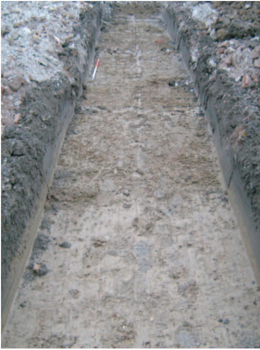
Plate 2: Trench 2