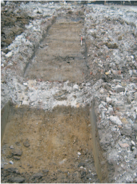
Plate 3: Trench 3