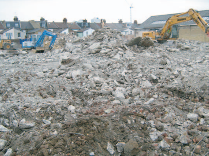
Plate 4: General site shot