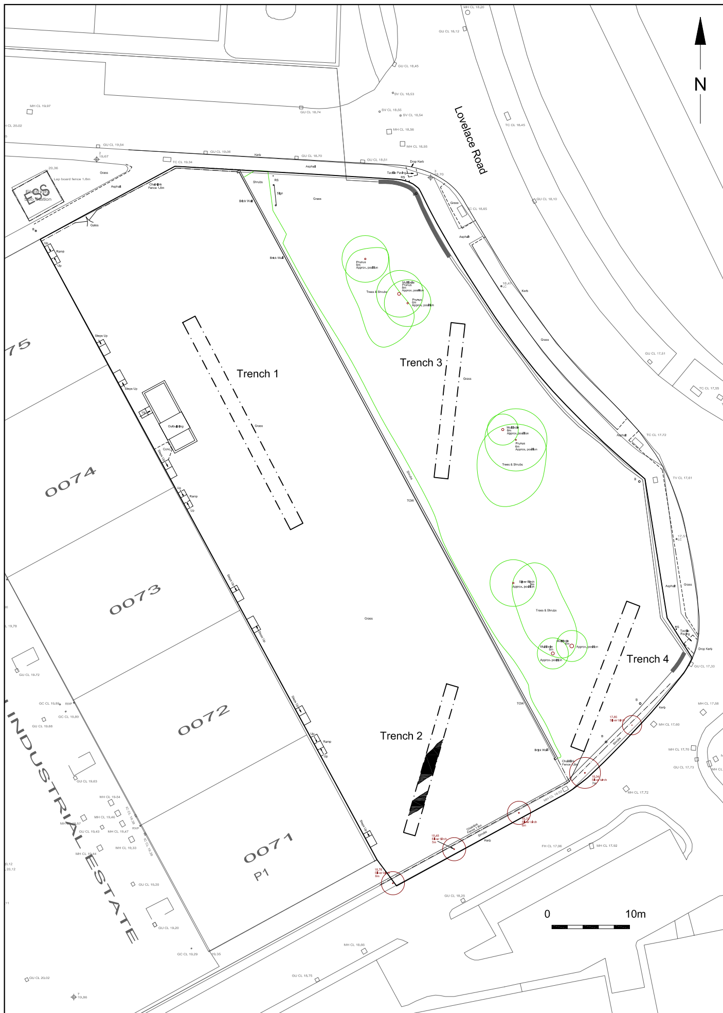
Lovelace Road, Bracknell Fig. 2 Ref: 2504 June 2006 Drawn by: JLR Trench Location Plan